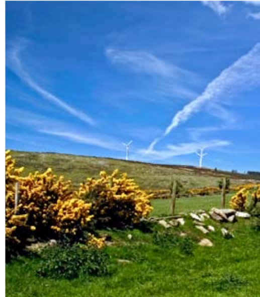
Below left: Mica Schist – found on Slievebawn and Tomduff

Continue straight ahead and turn right approx. 2km (1.25 miles) from the Nine Stones Viewing Point, where signposted. Distance from Nine Stones Viewing Point to Bunclody is 11km (7 miles).