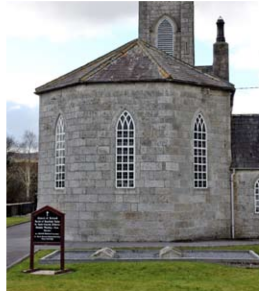
St. Lazerian's Roman Catholic Church