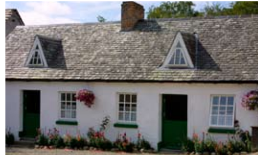
Countryside around Clonegal, favourably referred to as the Switzerland of Ireland