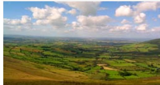
Bunclody Golf and Fishing Club