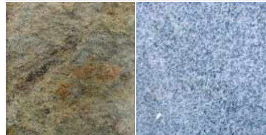
Below right: granite, principle rock type of the Blackstairs Mountains