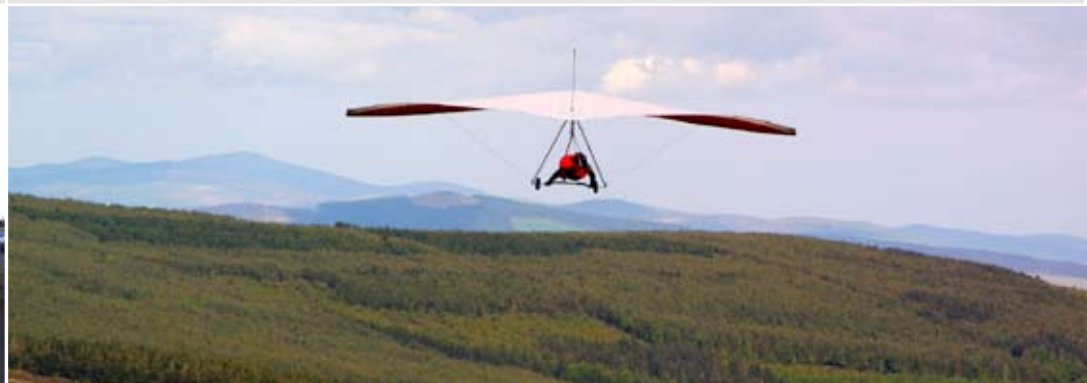
Hang gliding over the Blackstairs Mountains