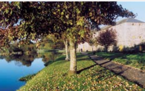
Bagenalstown Railway Station, considered one of the finest in the country