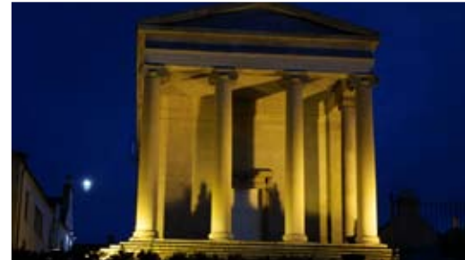
St. Mary's Church of Ireland Church