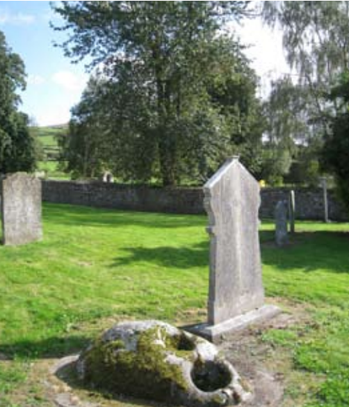
Remains of the church dedicated to St. Finian in the 6th century